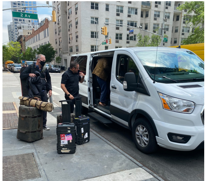
Film team packing up